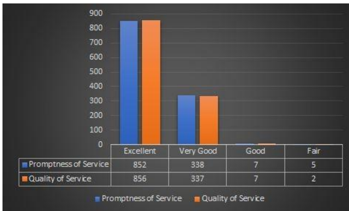
Figure 1: Graphical Presentation of Rating based on Aspects of Service