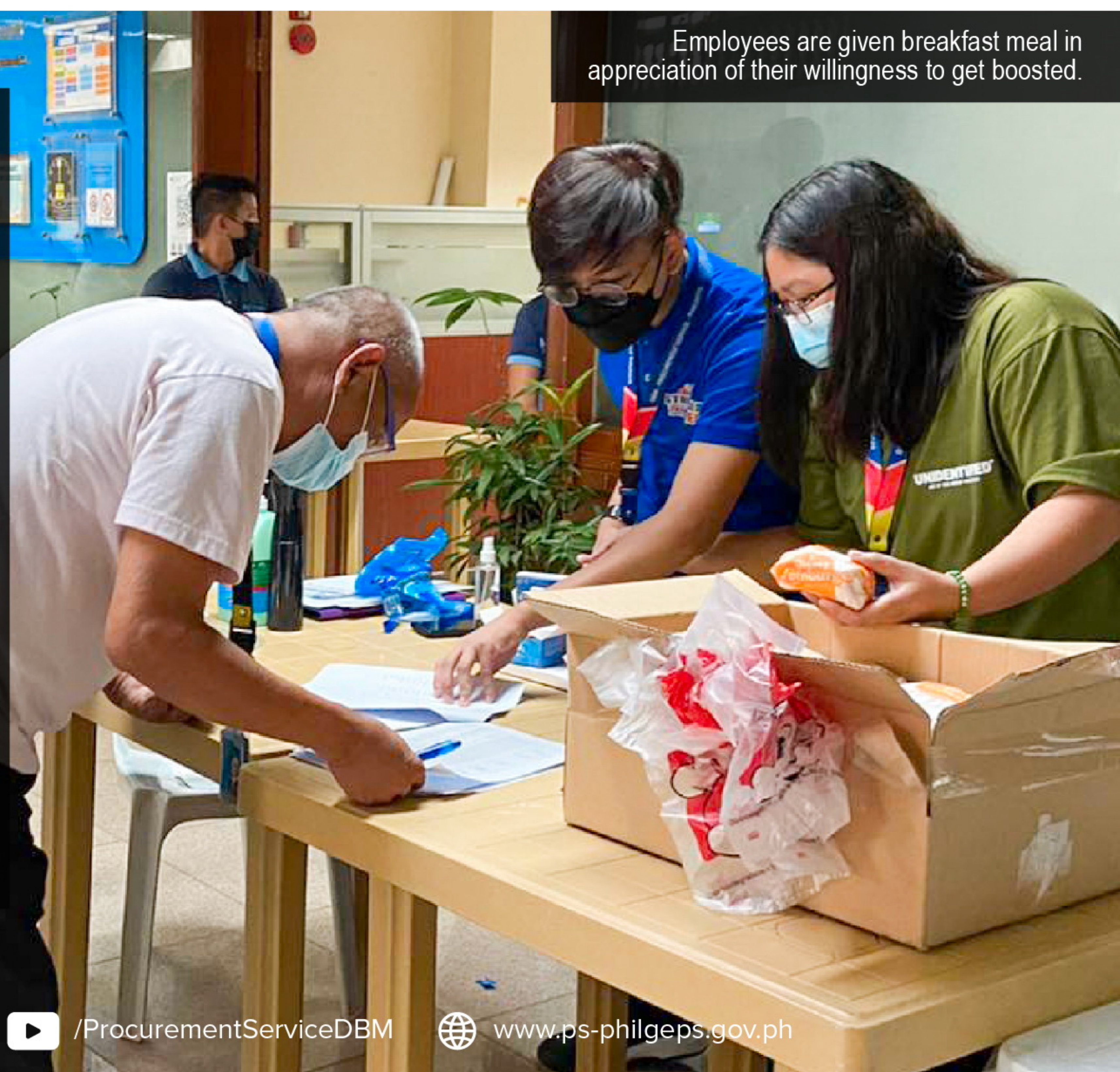
Employees are given breakfast meal in appreciation of their willingness to get boosted.

From January 19 to 20, 2022, roughly six months after the administration of their vaccine doses, a total of 761 personnel of the Department of Budget and Management (DBM) — including its attached agencies PS-Philippine Government Electronic Procurement System and Government Procurement Policy Board-Technical Support Office — were inoculated with the Moderna booster shot. The vaccination drive, organized by the DBM in collaboration with the Manila Health Department, was held at the DBM Central Office in San Miguel, Manila.