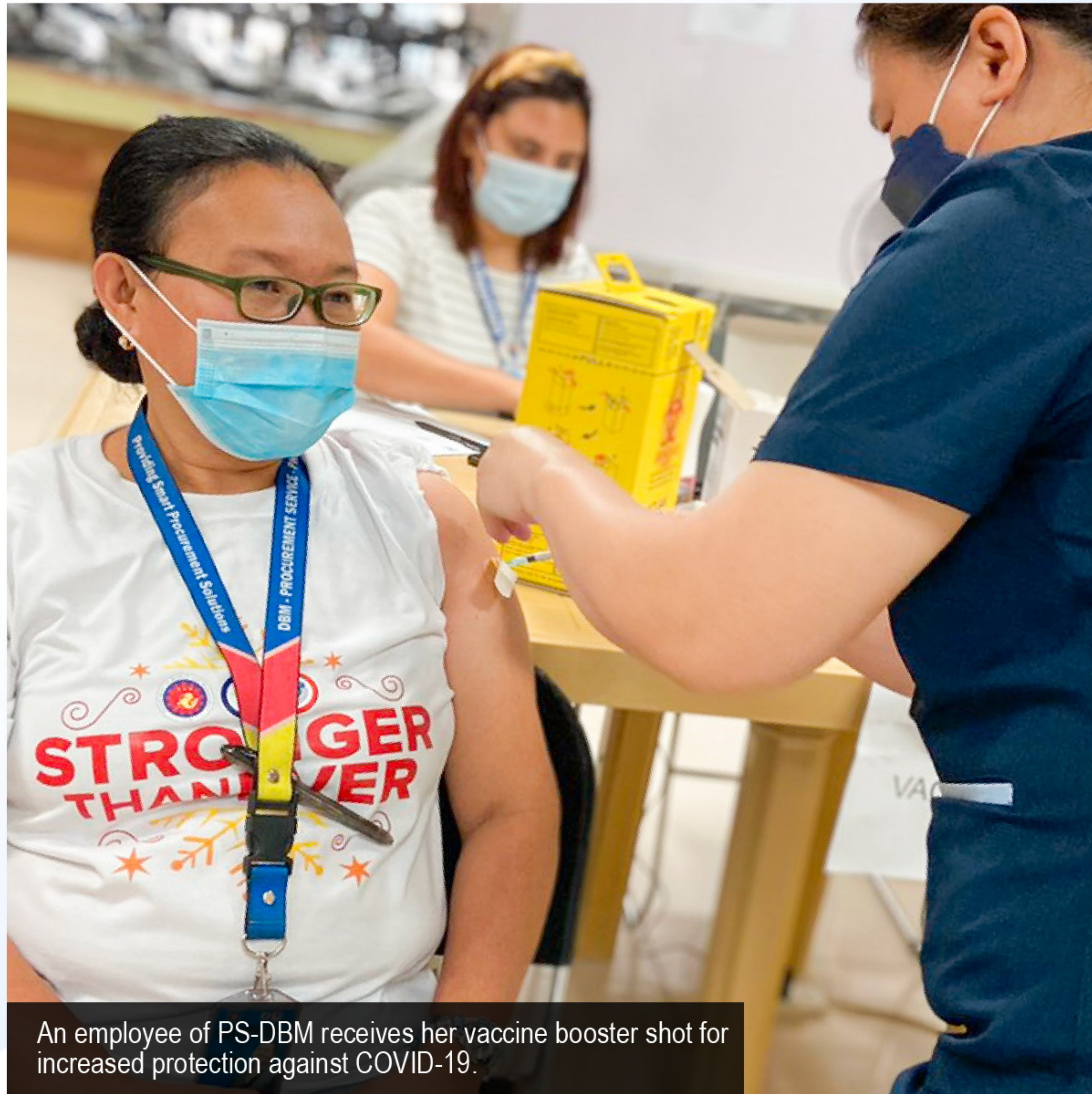
An employee of PS-DBM receives her vaccine booster shot for increased protection against COVID-19.