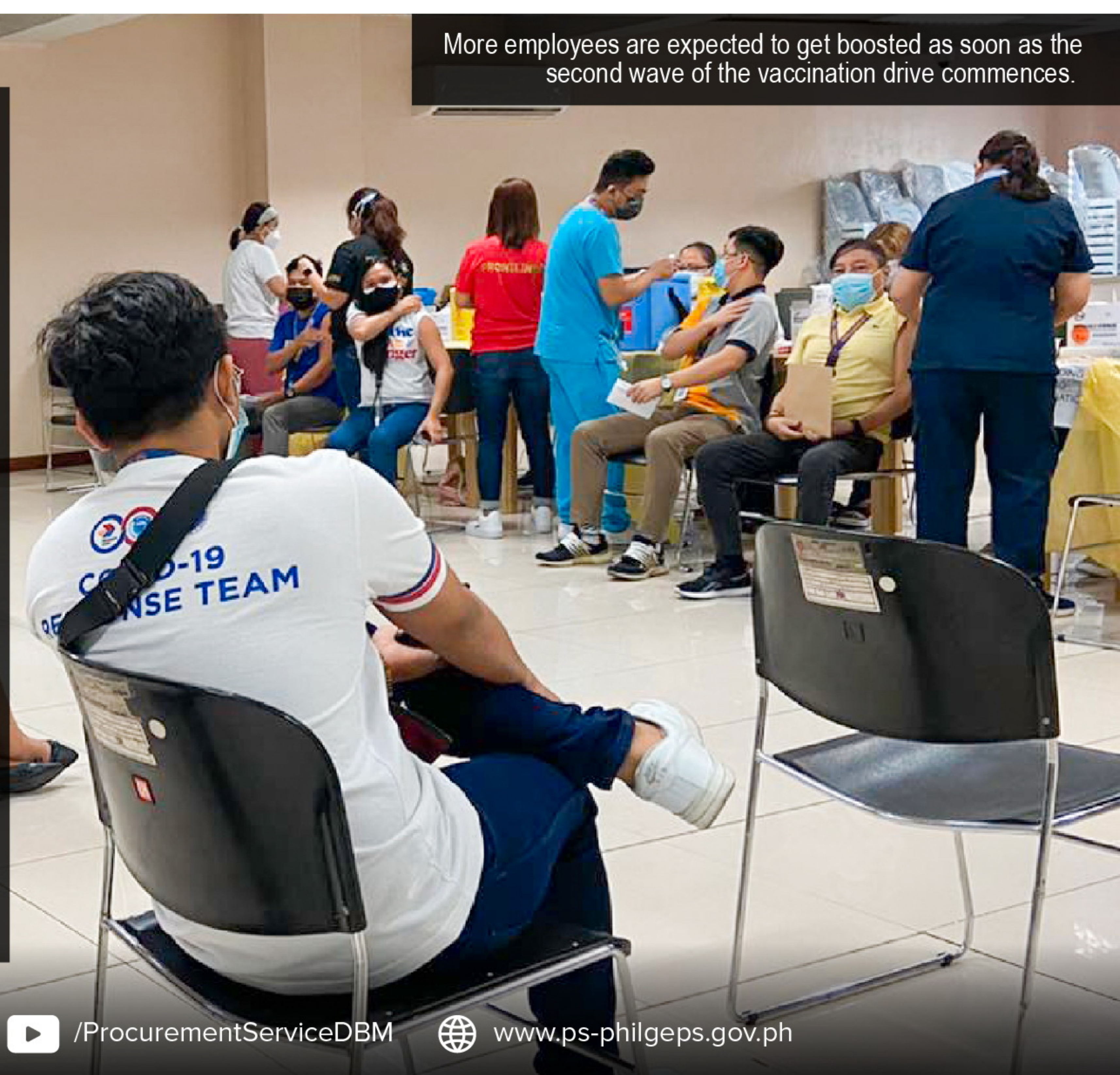
More employees are expected to get boosted as soon as the second wave of the vaccination drive commences.

By PS-DBM Communications communications@ps-philgeps.gov.ph