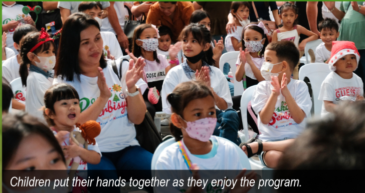
Children put their hands together as they enjoy the program.

It was evident in the smile on the guests' and visitors' faces that the event was a good time as they joined in activity booths that featured fun games such as basketball, ring toss, bottle shooting, balloon popping, drawing and coloring, among others. They were also treated to an enchanting experience with a magic show.