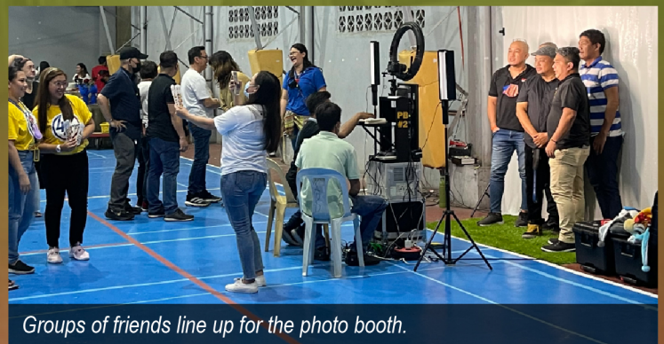
Groups of friends line up for the photo booth.