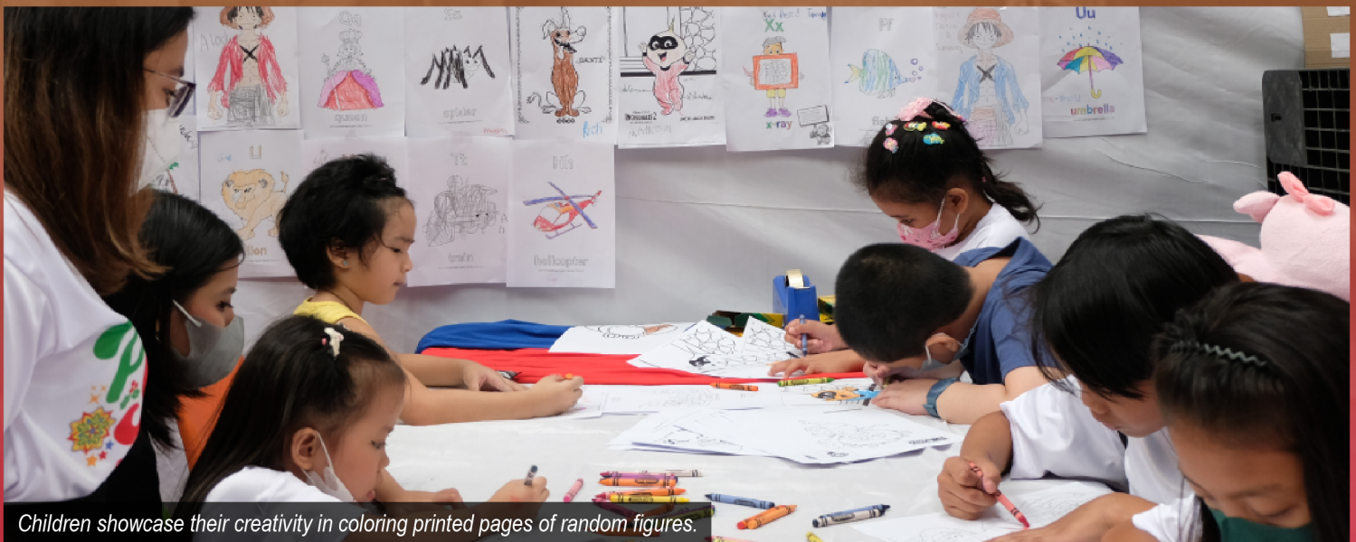
Children showcase their creativity in coloring printed pages of random figures.