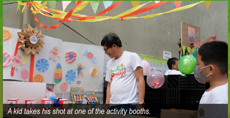
A kid takes his shot at one of the activity booths.