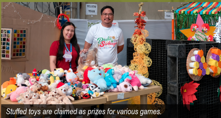
Stuffed toys are claimed as prizes for various games.