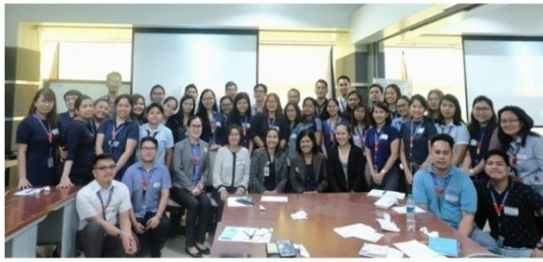
19 November 2019 (Day 1)