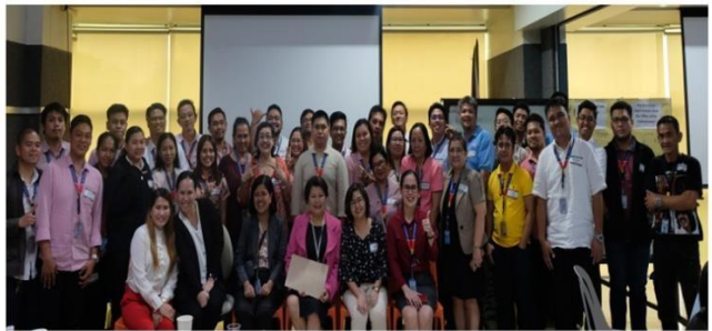
21 November 2019 (Day 2)-Group 2