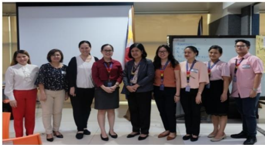
OMB-NIC and PS-PhilGEPS