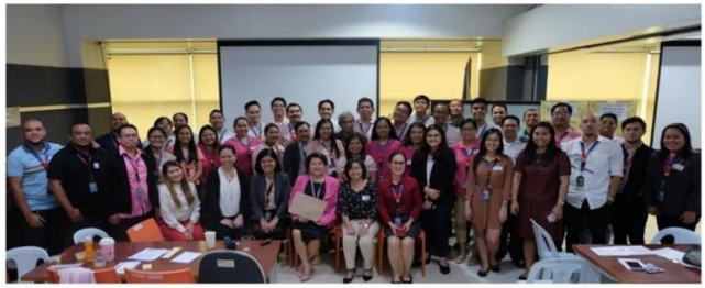
21 November 2019 (Day 2)-Group 1